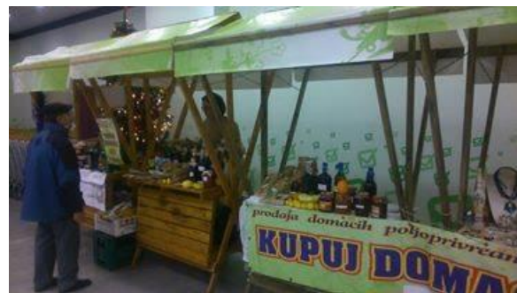
Sales area provided for homemade products of women association "Wake Up!"