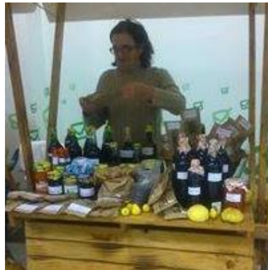
Women selling hand-made products in safe and secured space

not have a concentrated place of business, they were under the constant surveillance of local police. By granting them a separate physical space that was safe and secured, some women were able to increase their income. Equally important, the move created the conditions for a safe and productive economic participation of a vulnerable group that also enhanced their own physical safety and mental well-being.